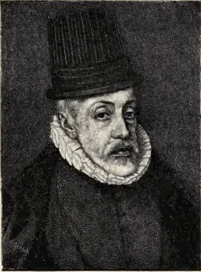
PHILIP II. IN HIS OLD AGE

Painting by Antonio Moro, Museum del Prado, Madrid.